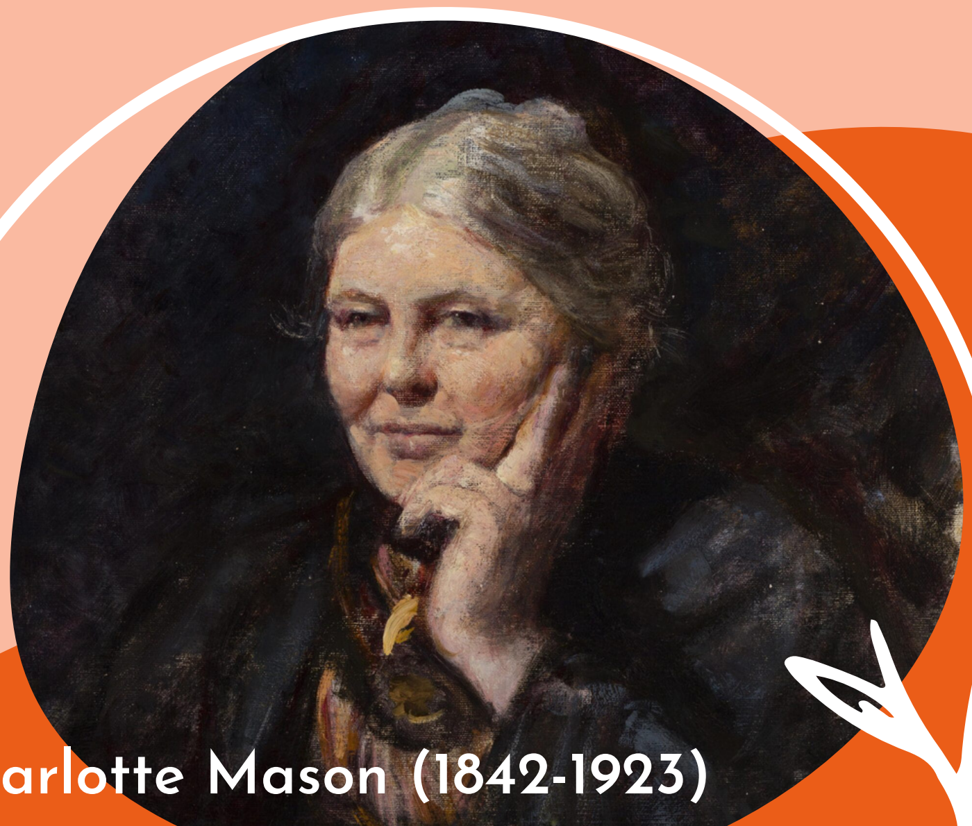
Charlotte Mason (1842-1923)

Upon her death The Times called Mason the foremost educationalist of her day. Her 'revolutionary' ideas led to the formation of the Scout Movement, reached most corners of the globe from Ambleside, and, by the present day, made their way unnoticed into the UK national curriculum. Today, tens of thousands of home educating families follow her person-centered methods. Until now, her ideas have never been applied to management and organisation thinking.